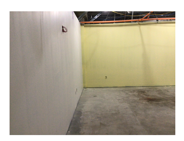
Painting in the classrooms on level 2.