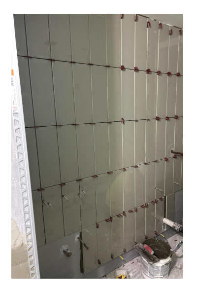
Installing ceramic tiling in restrooms on level 2.